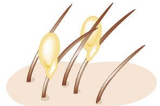
Louse eggs glued to hair shafts. Eggs are the size of a small pinhead